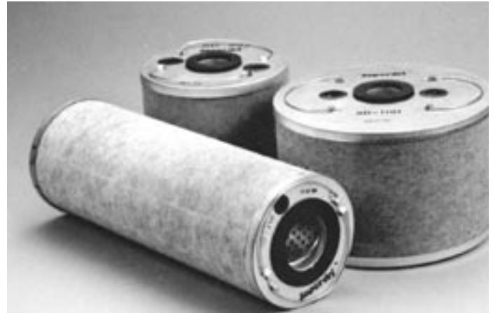
Models SD-718, SD-807, and SD-1107, respectively.

Superdri cartridges are not designed for particulate removal. Prefiltering through Velcon 1/2 micron elements is recommended if particle contamination is suspected. Superdri cartridges are not recommended for cost effective removal of free water in insulating oil. If free water is suspected, the oil should be prefiltered using Velcon Aquacon ® elements.